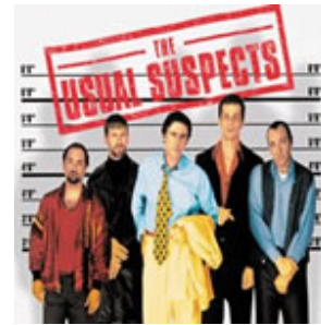
Who is Kaiser Soze?